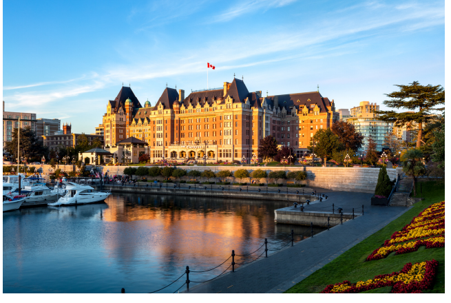
The Fairmont Empress