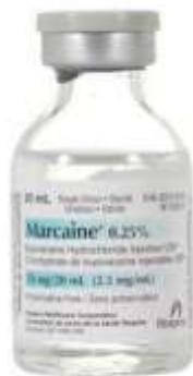
New Sterimax Bupivacaine Product