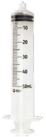
New BD® 50 mL Syringe